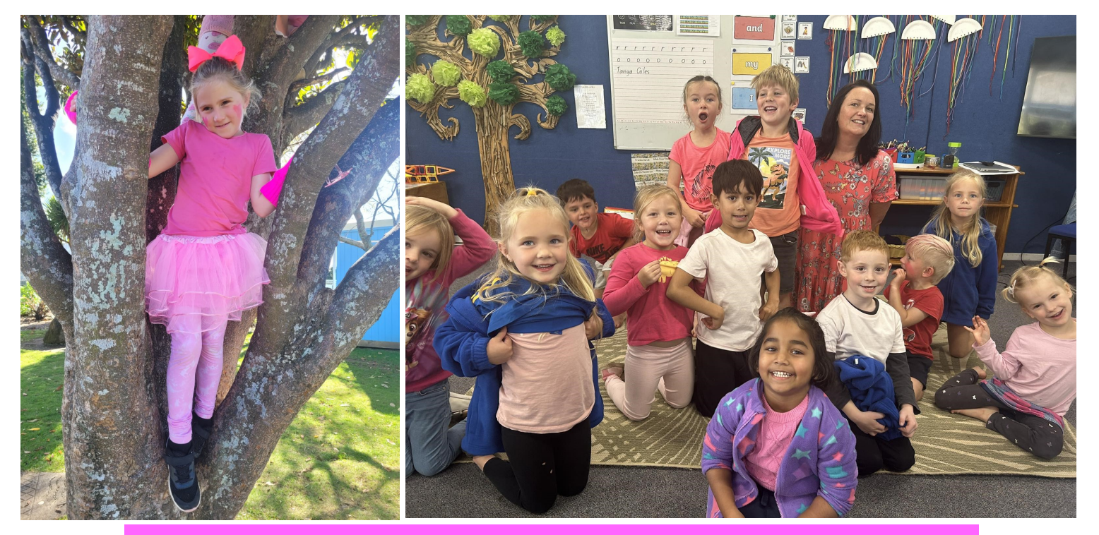
Pink shirt day