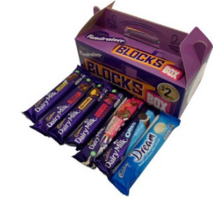
Cadbury BLOCKS BOX 36 Pack 45g – 60g $2.00 RRP x 6 Carry Packs

The bars are $2 each. There are 36 bars in each box. So $72 all up. Thanks