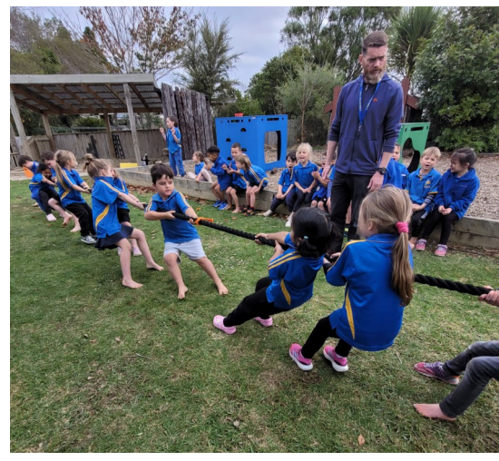
Discovery Centre & Room 8 Tug of War